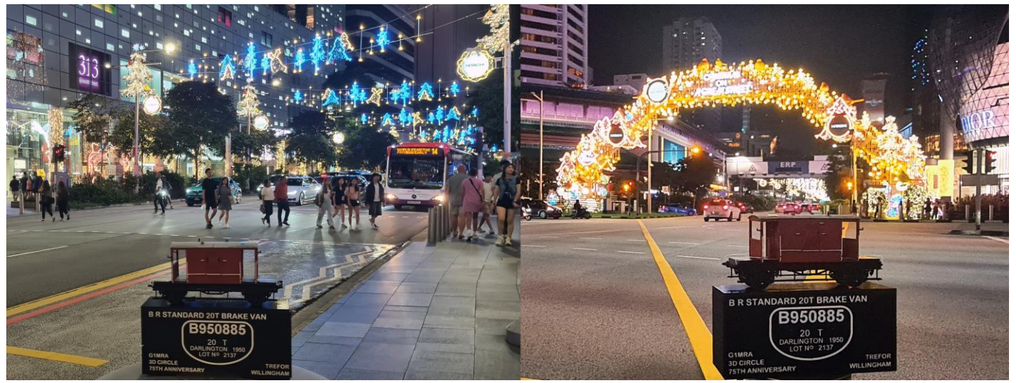
The Christmas lights illuminating Orchard Road, Singapore's' equivalent of Oxford Street. This is about 10pm and its all still going strong with everything still open and trading.