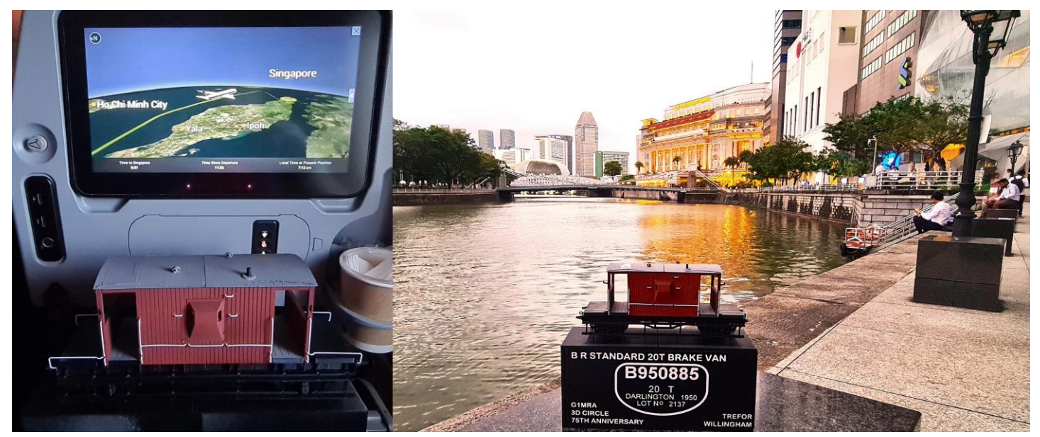
Arriving in Singapore from Manchester after a 13-hour day-night long haul, courtesy of Singapore Airlines; and at Boat Quay on the Singapore River outside the Fullerton Hotel. The Singapore Parliament Buildings are on the opposite shore.

The longer-term plan is to hand it over to somebody else to take it on and get it across to more of Australia and then North America before heading back to the UK. We shall see. In the meantime, here is the story of its travels out to NZ as the first part of the story.