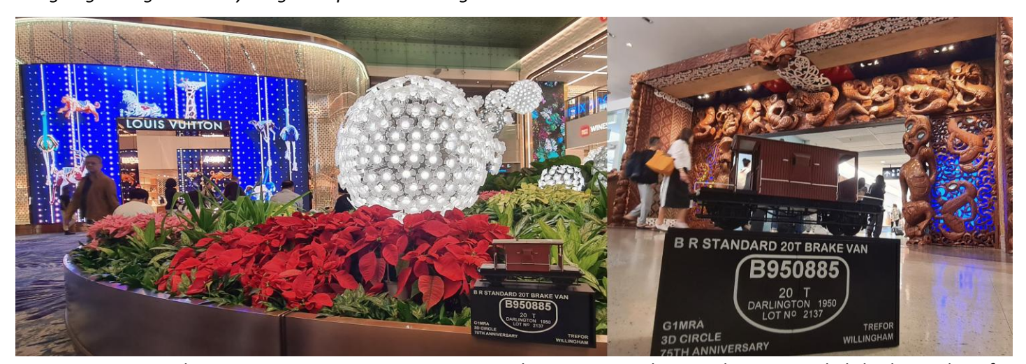
Having spent a week in Singapore, it was time to continue the journey south east. This time, a slightly shorter leg of 10 hours albeit starting at the unhelpful time of 1am local time! This brought us into Auckland at 3pm NZ time, dazed and confused! On the left, the transit hall of T3 in Singapore awaiting our departure. The view on the right is the entrance into the arrivals hall in Auckland the following afternoon, complete with soothing birdsong.