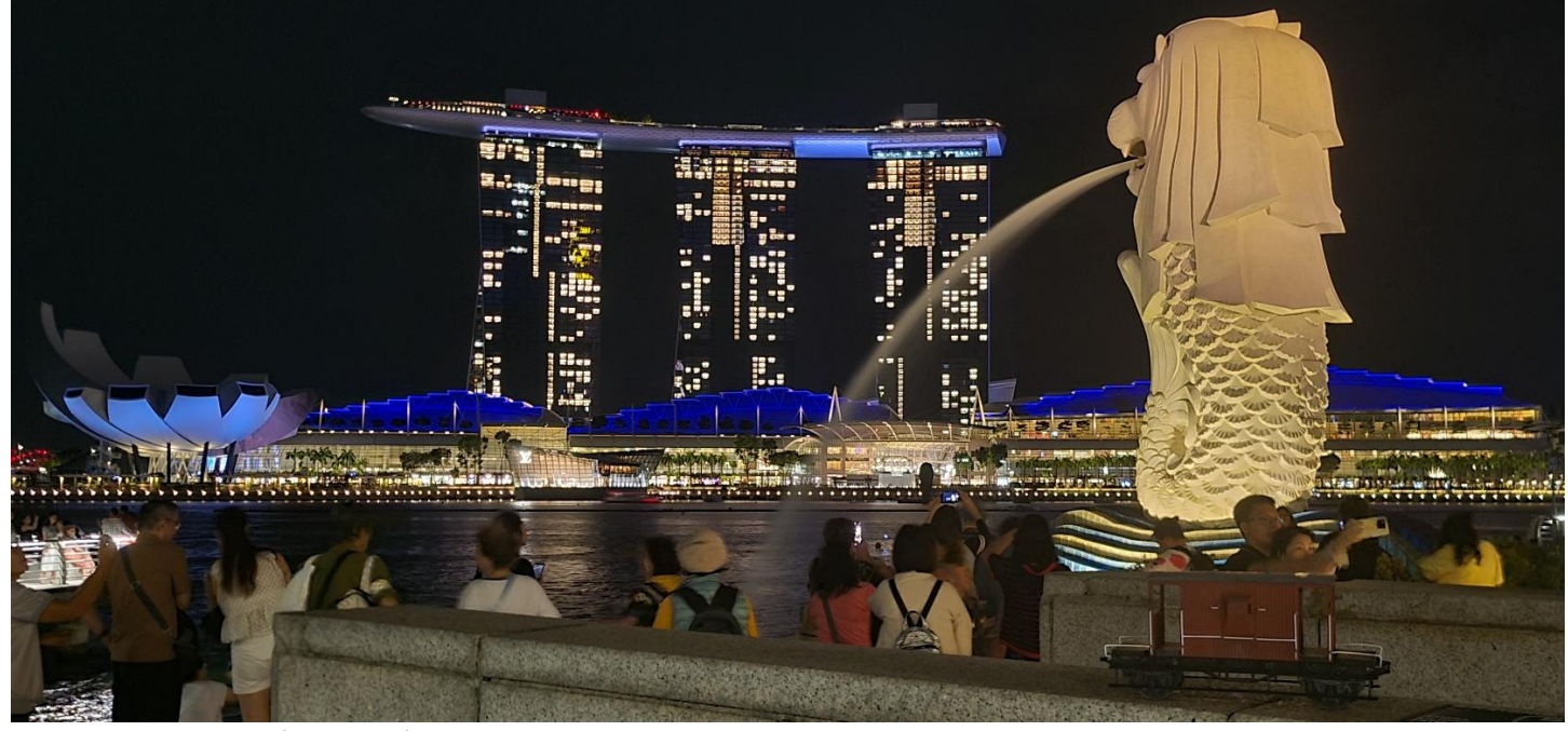
Around the corner after nightfall, the view across the recently encircled harbour looking past the Merlion across to the Marina Sands Hotel. The infrastructure including the hotel on the far side have all been built on land created since 2003 in what was open sea. This includes an underground rapid transit railway to form part of the country's ever expanding MRT system.