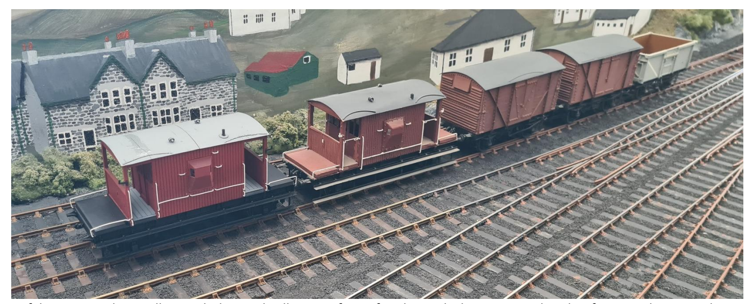
Safely ensconced at Mallaig with the total collection of 1:32 freight stock I have accumulated so far. N.B. the 3D Circle van is the one on the left!