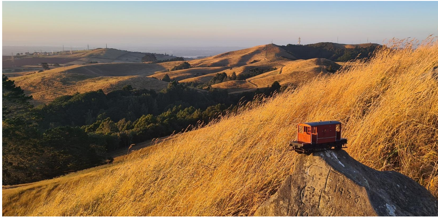
The view north from the summit. These hills present a barrier between Auckland and the Waikato Region to the south. The summit is right on the boundary between the Regions.