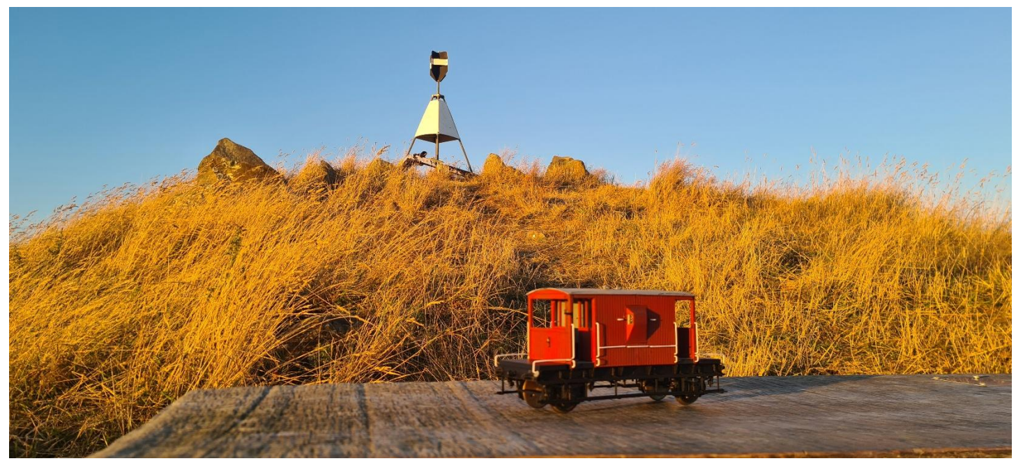
At the summit just on sunset.