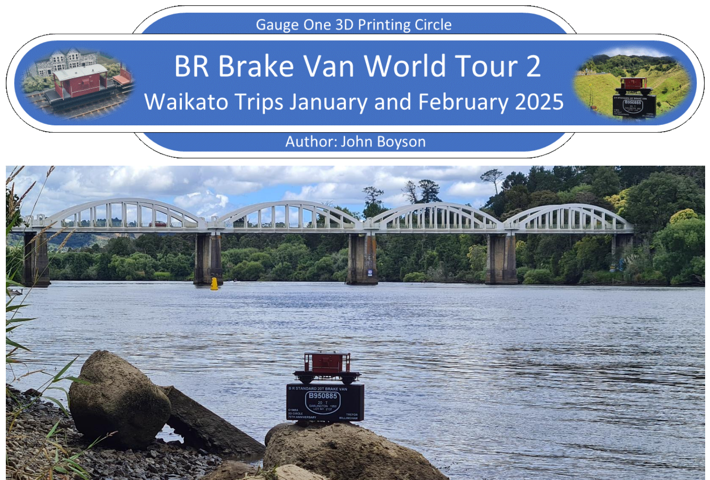
At Tuakau Bridge over the River Waikato, the last crossing before it reaches the sea. Tuakau's main claim to fame is as the town where Sir Edmund Hillary grew up. The river's source is Lake Taupo visible in the centre of the North Island on the map on the left below.

This, the second newsletter covering the Brake Van's travel's, focuses on its initial explorations in January and early February locally around the North Waikato Region where we reside between Auckland and Hamilton.