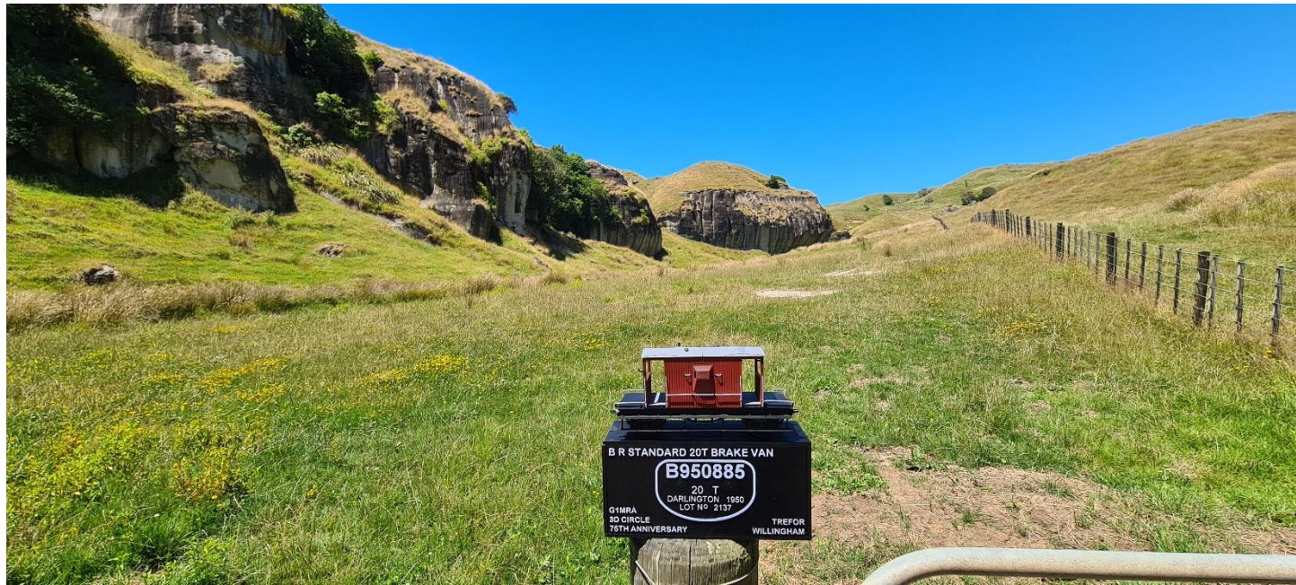
South west from the Tuakau Bridge takes us into some fairly remote countryside not often visited. It's limestone country with numerous outcrops, one of which is quite well known.