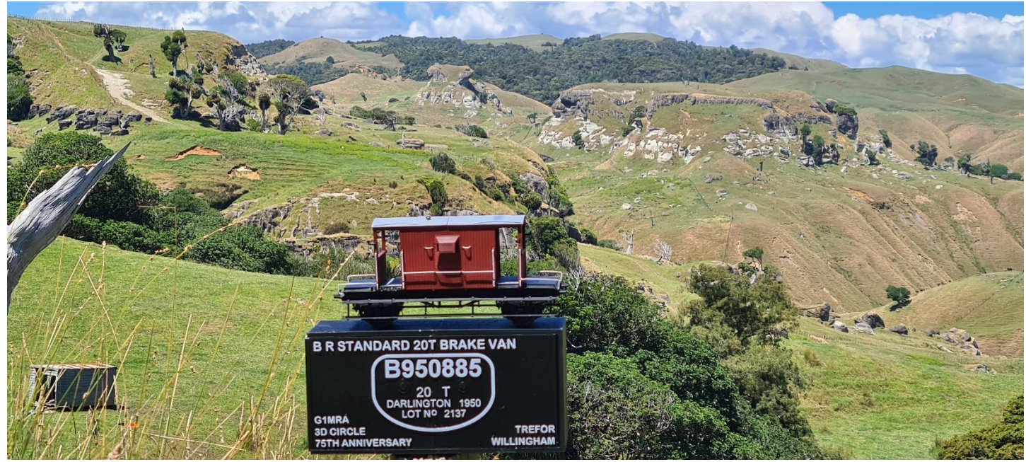
This is 'Weathertop'. For Lord of the Rings fans, it is the scene where Frodo was stabbed by the 'Black Riders' in the 'Fellowship of the Ring'. For those not sure, it's the mushroom topped outcrop directly above the brake van.