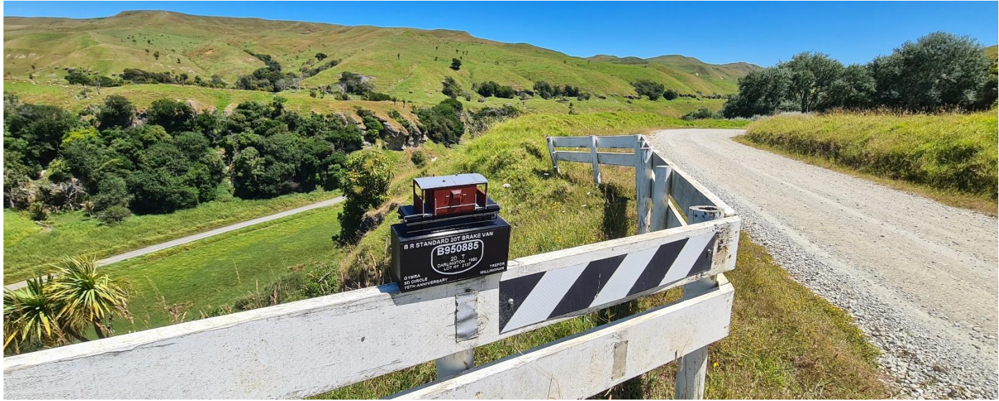
A little further south, the road reaches an impasse where it has to zig zag down to get around a line of cliffs. The continuation of the road is visible below the cliffs.