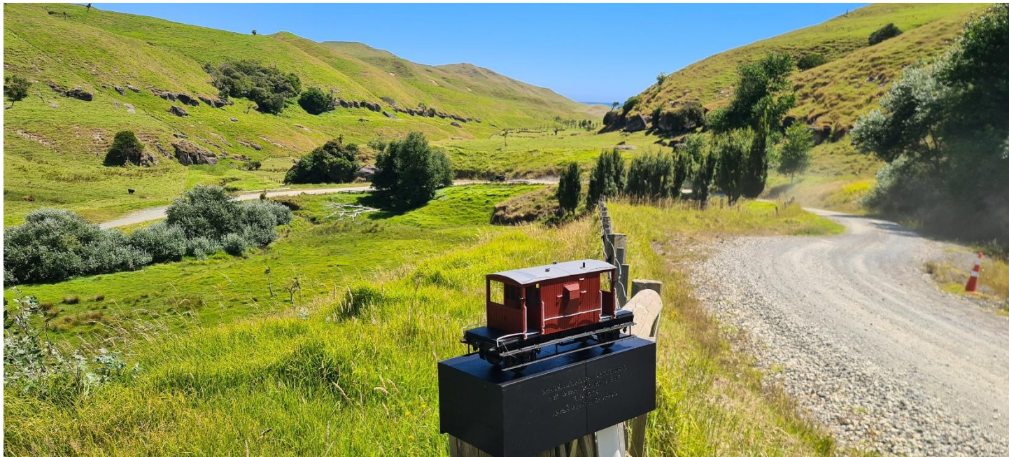
Reaching the base where the road does a hair pin turn to follow the valley back inland again. The Tasman Sea is just visible in the gap above the brake van.